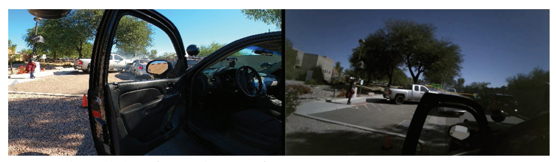
Figure 1. Synchronized body cam footage and eye camera footage.